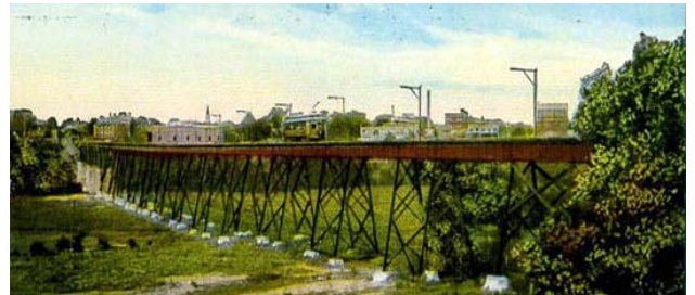
Interurban Bridge and Danville, 1915