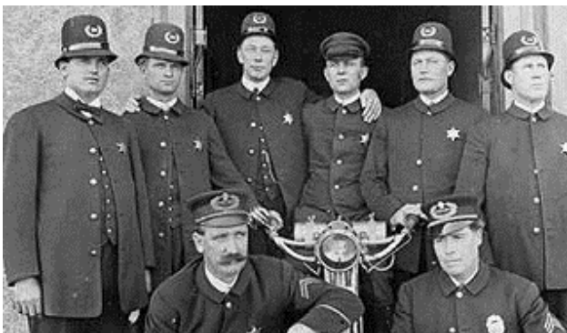
The Danville Police Department, 1916