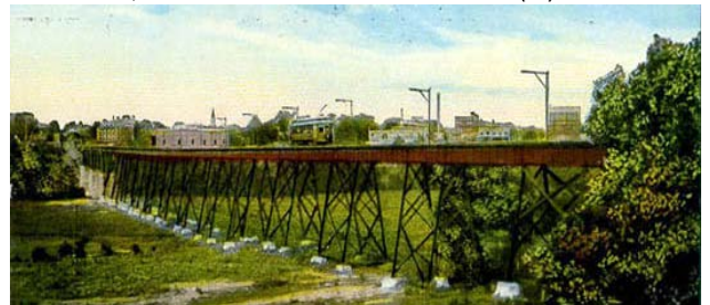
Interurban Bridge and Danville, 1915