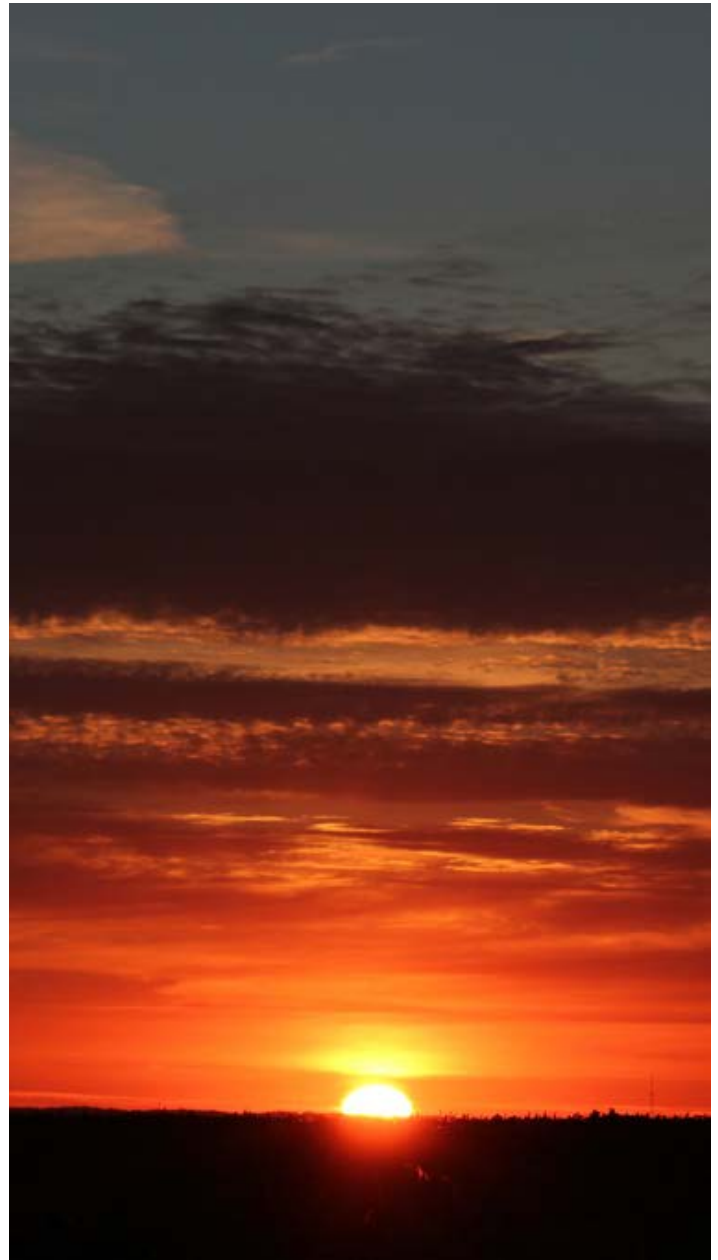
Sunset in Vance Township

Homer, 61841 ..... Information not provided