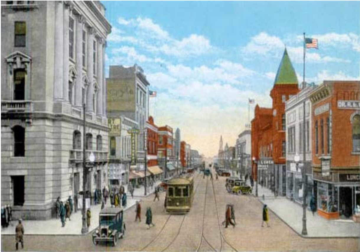
Main Street in Danville, looking east from public square, 1925